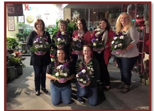
Mason City, IA

If you were not able to make it to our January class, well... YOU missed out! The ladies who participated in our Mason City and Charles City classes did awesome work on their Chinese New Year and Winter Blues' themed fresh arrangement; this class lasted about an hour and only cost $35! You can't beat that!!