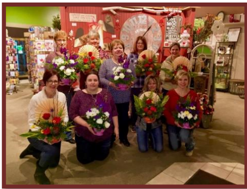
Charles City, IA

Don't forget Valentine's Day!! During this awards season, earn a nomination for Best Sweetheart by selecting a gift from Otto's Oasis. If its flowers you want, we've got you covered, but don't forget our other gift offerings. We have GingerSnaps jewelry, Michel Design Works bath and body products, and clothing accessories. How about our salsas if you wish to spice things up? Here at Otto's, we want to help you make your Valentine's Day as special as your Valentine is to you.